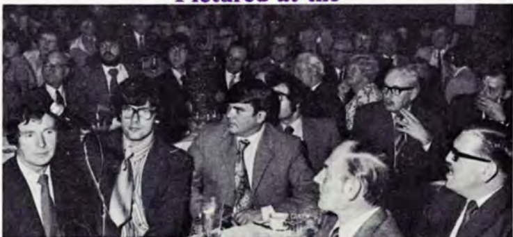
North Mersey District