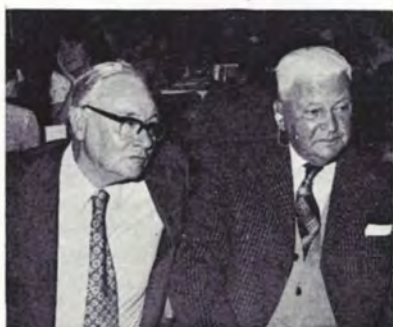
Some of the delegates —past and present— who attended the Mid- Cheshire Employees' Annual Meeting