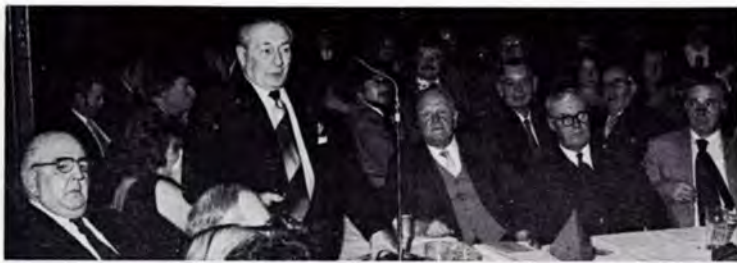
Pictured at the

Bringing the informative and interesting Meeting to a lively close was an 'Open Forum' session with questions on a variety of subjects answered in full, or partially, by senior staff from Head Office and the District.